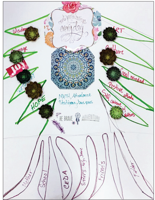
CEDA Pathways Parents Tree of Life, May 2017

offering of tobacco and what can be done after the responsibility signified in the passing of tobacco is completed. Unfortunately we weren't able to incorporate this process because the fire pit